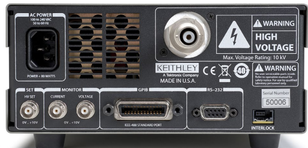
2290-10 rear panel showing the IEEE-488 interface connector, RS-232 interface connector, high voltage output connector, analog control/output connectors, and interlock connector.